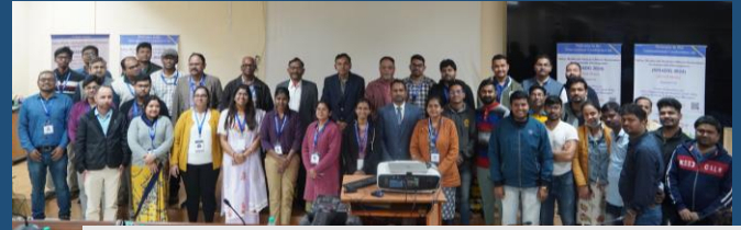
Organizing team of international conference SHADG 2024

A Conference Abstract Proceedings which includes all the abstracts presented in SHADG 2024 is published in the Centre website ( Click here to read).