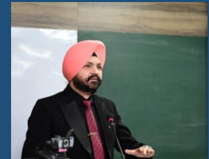
Participants of 3 rd batch of LPSE sharing their experience and feedback about the course