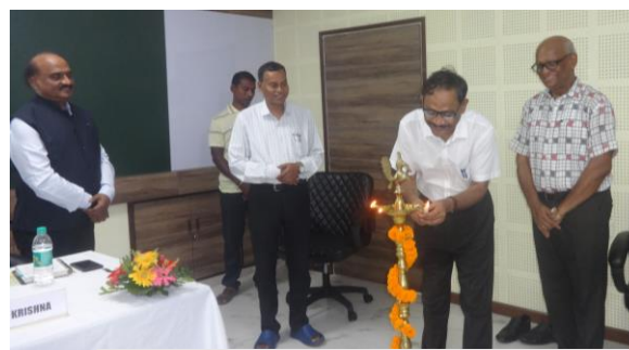
Lamp-lighting ceremony during the inaugural ceremony of the course on LPSE