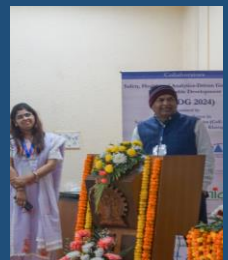
Participants of LPSE attending the international conference SHADG 2024