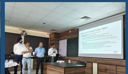
Few snapshots during the classroom lectures, group discussions and presentations