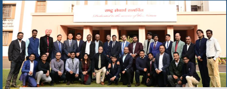
Adani group nominated participants of 3 rd batch of LPSE along with IIT professors and scholars of CoE-SEA

In addition, the participants of Batch 3 got an opportunity to participate in the International Conference SHADG 2024 also. Few of the participants from this batch and earlier batches presented impressive papers on their research and inputs on safety, risk assessment, HAZOP, human errors, etc. The responses from the participants towards the conference were appreciable, and they commented that they gained even more insights from this conference, apart from the course learnings by interacting with other industry experts, research scholars, academicians, etc. who attended the conference.