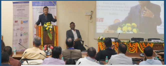
Snapshots during the international conference SHADG 2024

CoE-SEA organized the conference SHADG 2024 in collaboration with the following: